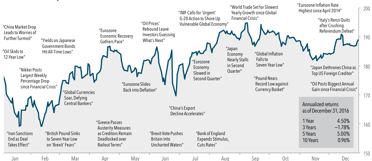
Chart 2: Non-US Stock Market Performance MSCI All Country World ex USA Index with selected headlines from 2016